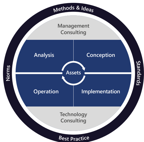
Figure 1: Strategy Orianda Solutions AG - a valantic company

Once the implementation of the new Asset Management architecture with the go-live has been successfully completed, operation begins - as an ongoing task in which we also support our customers.